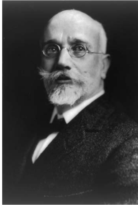
Figure 6.1 Eleftherios Venizelos (1864–1936), reformer and statesman.

her attack. The war lasted one year and helped Italy's expansion in the Mediterranean. With the Treaty of Ouchy in October 1912, Libya became an Italian protectorate. In May 1912, the Italians took over the Dodecanese, thus proving how vulnerable the Ottoman Empire really was. The war gave the opportunity to the inhabitants of Samos to rebel against Ottoman rule. Their exiled leader, Themistoklis Sofoulis, landed on the island on September 7, 1912, as head of a Greek volunteer force and chased away the Turkish garrison.